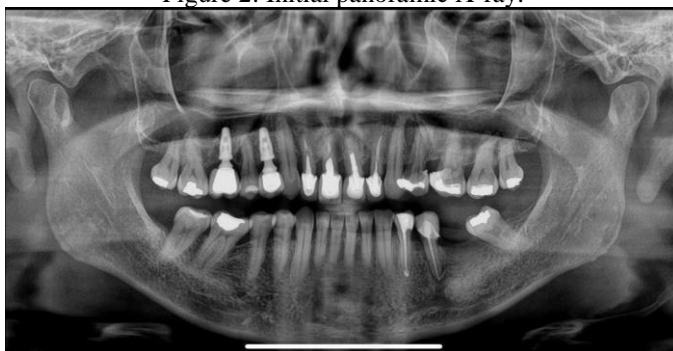
Figure 2: Initial panoramic X-ray.