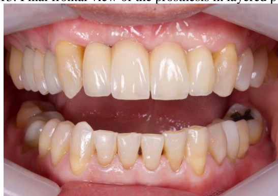
Figure 13: Final frontal view of the prosthesis in layered porcelain.