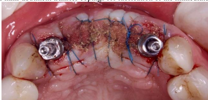
Figure 6: Placement of mini-abutment transfer copings for fabrication of the immediate provisional prosthesis.