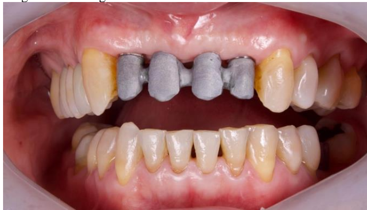
Figure 11: Fitting of the metal framework on the mini abutments.