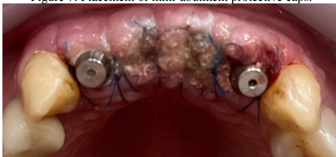
Figure 7: Placement of mini-abutment protective caps.