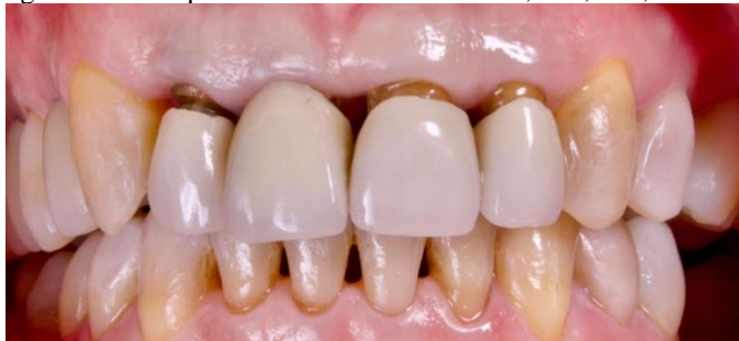
Figure 1: Initial presentation of elements #11, #21, #12, and #22.

Medical history and complementary examinations confirmed normal systemic health. Cone-beam computed tomography (CBCT) confirmed the clinical findings and revealed significant bone loss. The patient provided informed consent for publication of the case details and accompanying images (Figures 1, 2, and 3).