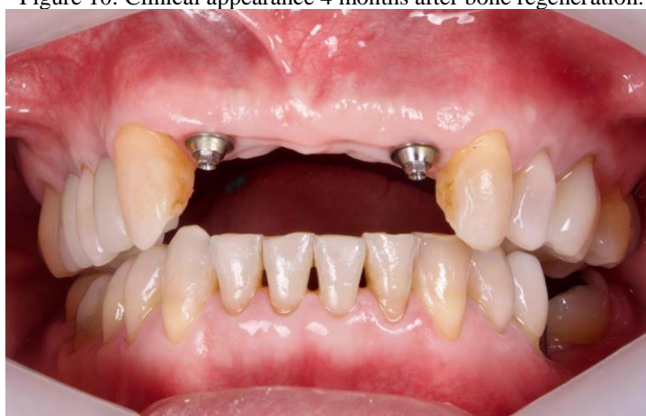
Figure 10: Clinical appearance 4 months after bone regeneration.