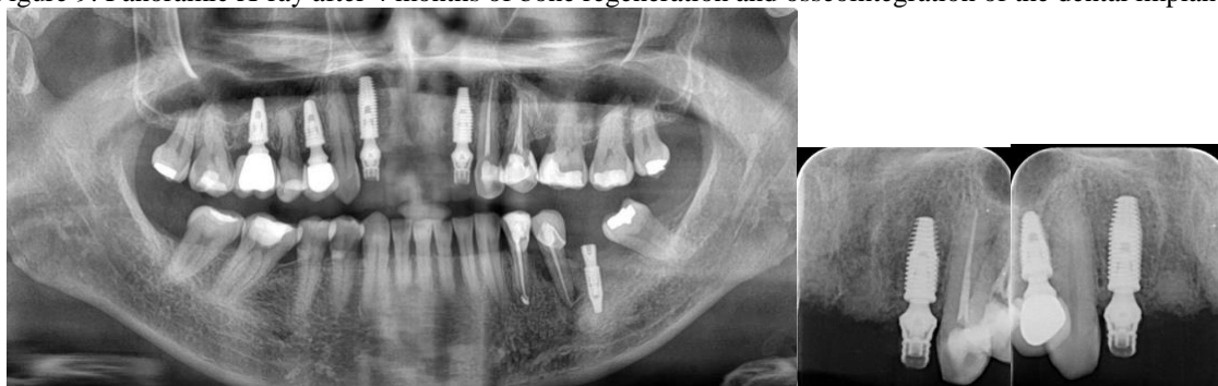
Figure 9: Panoramic X-ray after 4 months of bone regeneration and osseointegration of the dental implants.

The patient was followed monthly for 14 months, during which implant stability, possible bone loss, gingival health, and occlusal changes were assessed (Figures 9 -13).