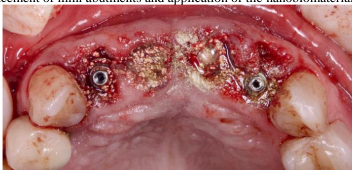
Figure 5: Placement of mini abutments and application of the nanobiomaterial Blue Bone®.