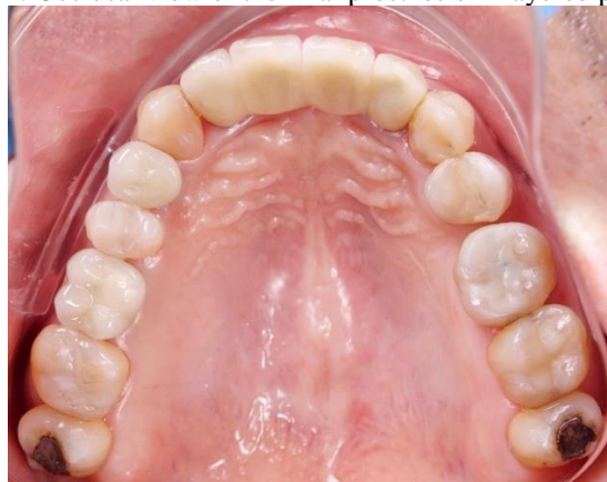
Figure 12: Occlusal view of the final prosthesis in layered porcelain.