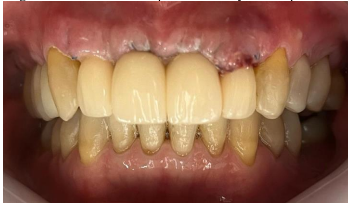
Figure 8: Installation of the provisional acrylic resin prosthesis.